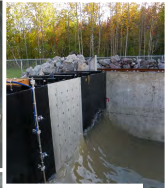
Force and impact monitoring