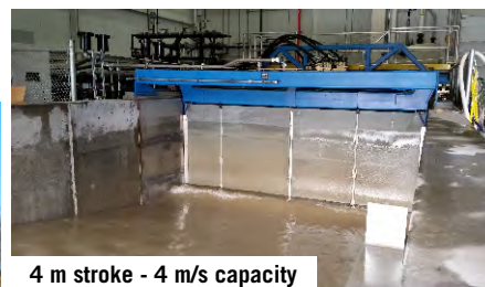
4 m stroke - 4 m/s capacity