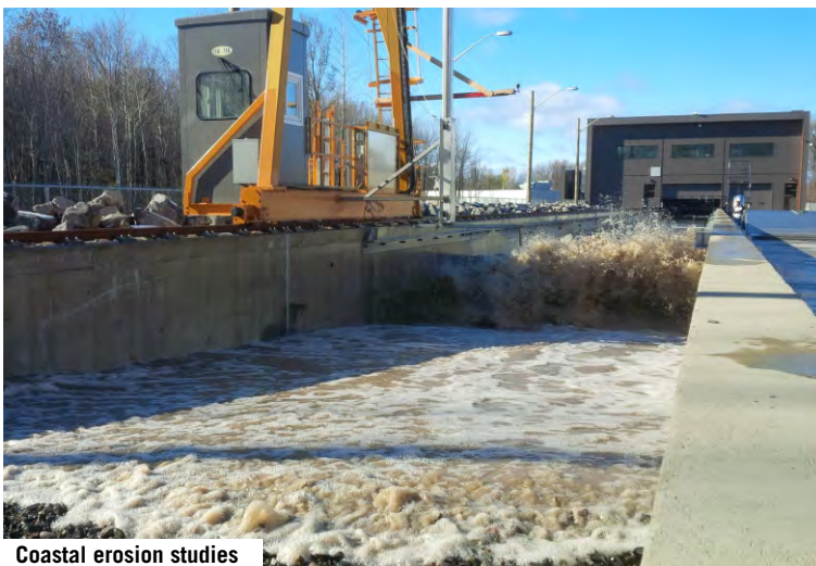
Coastal erosion studies